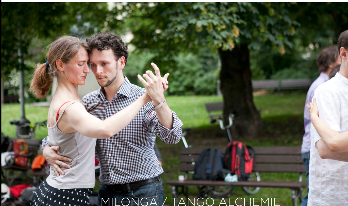
MILONGA / TANGO ALCHEMIE