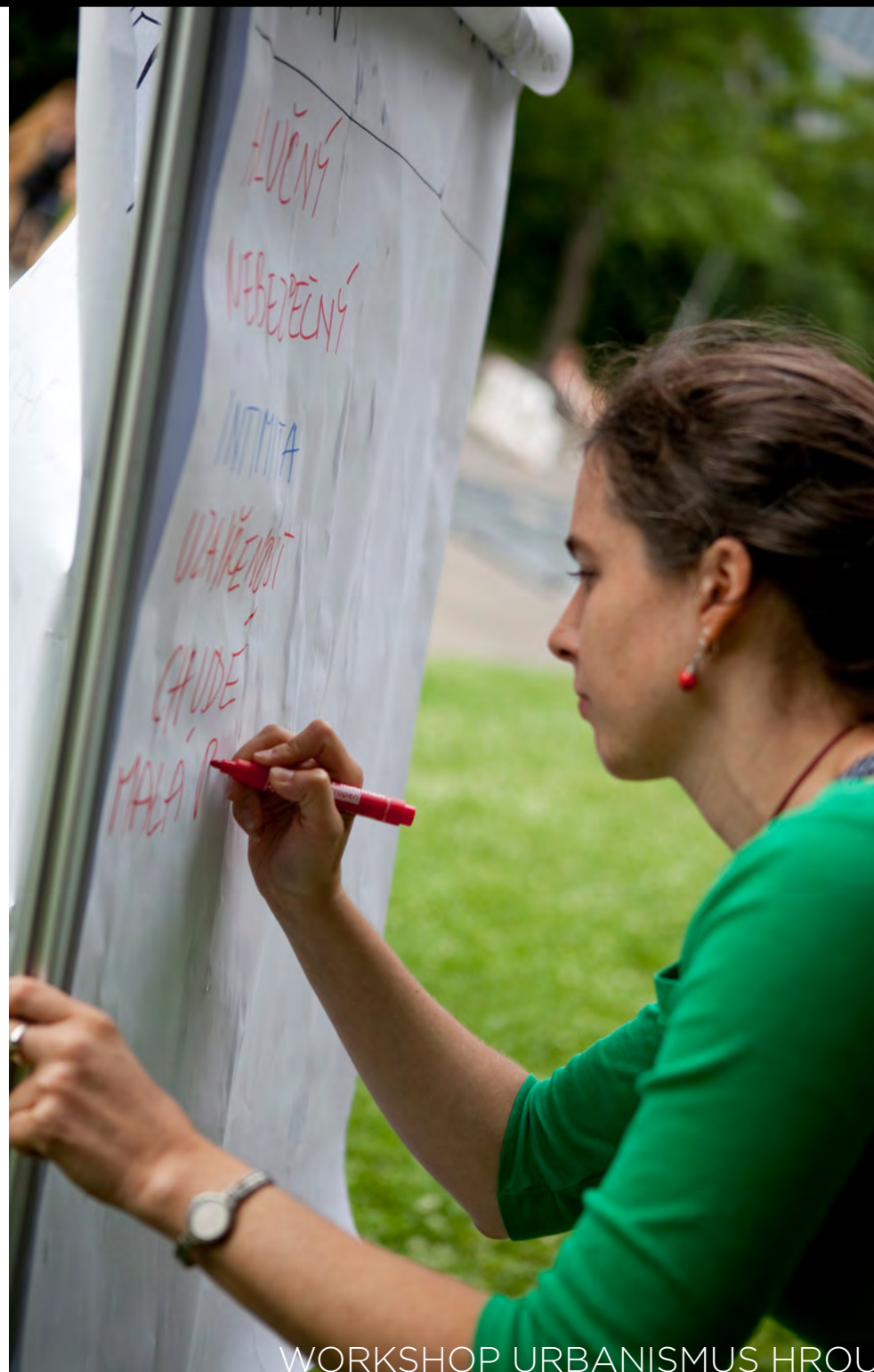
WORKSHOP URBANISMUS HROU